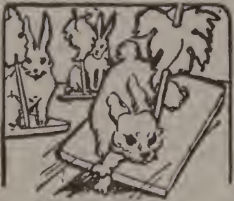
The Boats Skimmed Over the Ice.

“ I MUST tell you,” said daddy, “about the rabbits’ iceboating party. A big pond, which was very near the field where a great many rabbits lived—in fact, so many rabbits lived in the field that it was called Rabbit village—had frozen over.